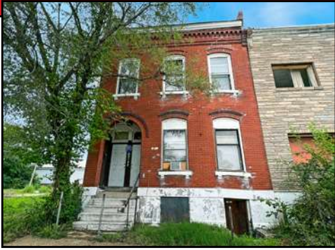
2743 Madison is a duplex. These photos are from the top unit.