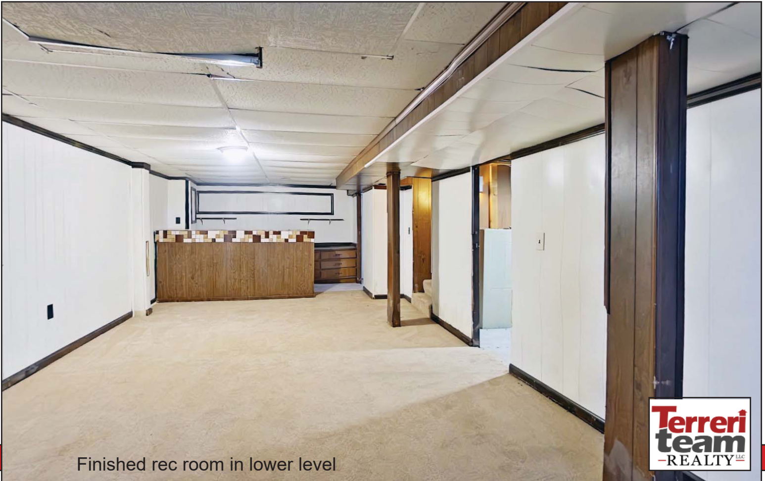
Finished rec room in lower level