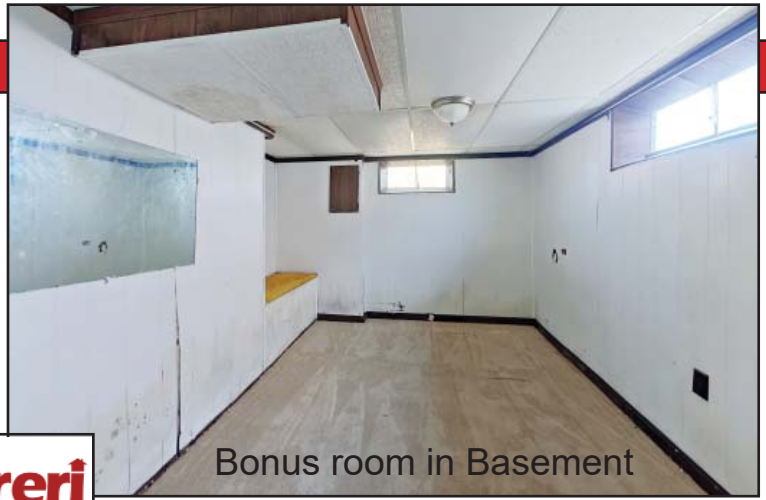
Bonus room in Basement