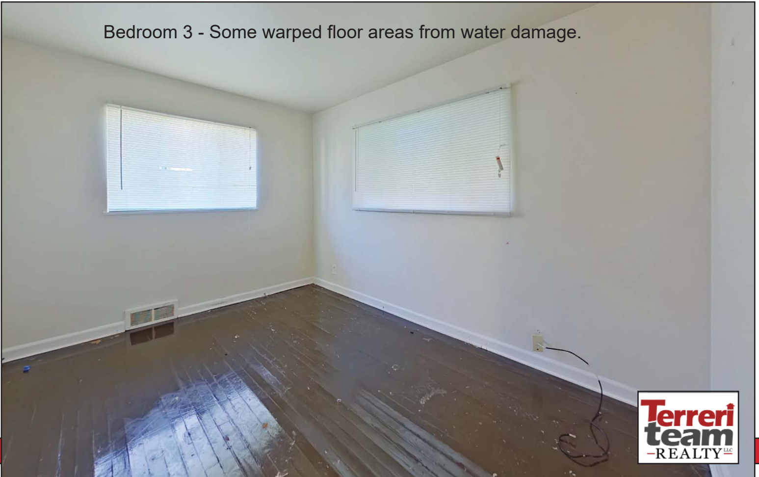
Bedroom 3 - Some warped floor areas from water damage.