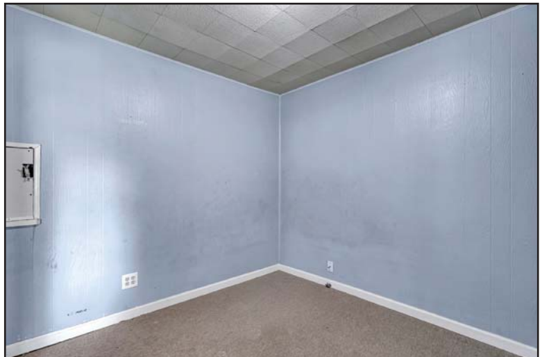
Bonus room off of the living room which might be able to be converted to a 3rd bedroom.