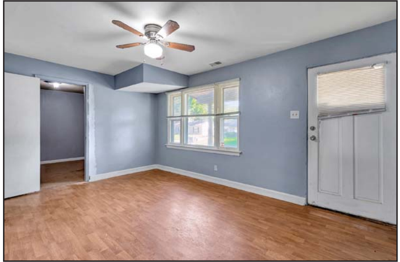
The door on the left goes to the bonus room which could be converted to a 3rd bedroom.