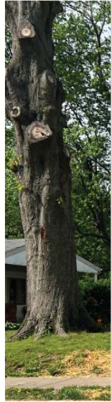
There is a tree that has been cut back in the front yard.